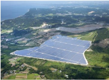
Futtsu Solar (40MW)