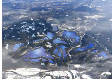
Karumai Nishi Solar (48MW, under construction)