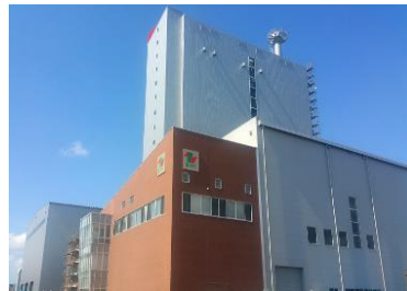
United Renewable Energy (Biomass)