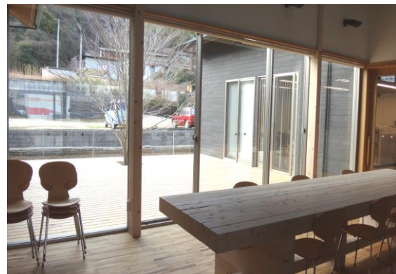
Wood deck space