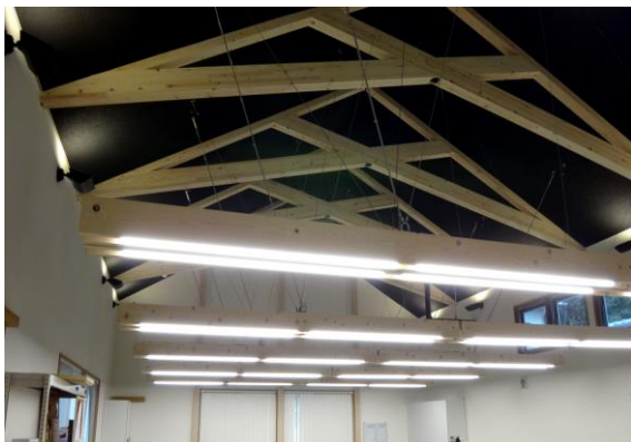
Office ceiling (scissor-truss)