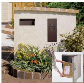
Home delivery box built into entrance gate