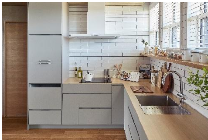
L-shaped kitchen usable by the whole family