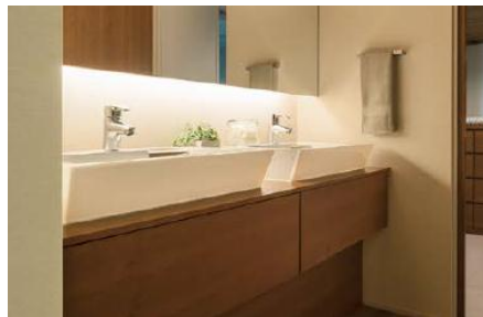
Double basins in the washroom