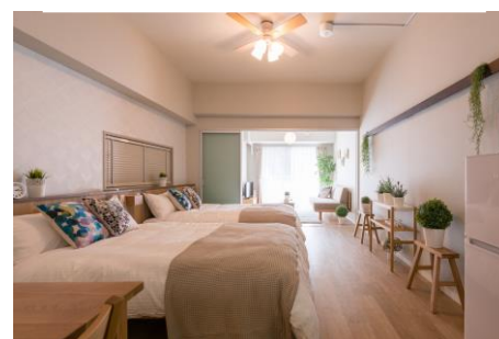
– Examples of interior designs –