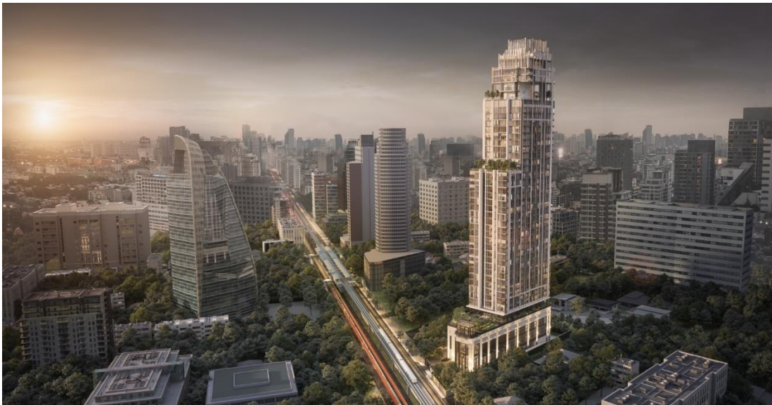
* Conceptual image

Sumitomo Forestry's wholly owned subsidiary Sumitomo Forestry (Singapore) Ltd. (hereinafter SFS), Property Perfect PCL (hereinafter Property Perfect), and its affiliate Grande Asset Hotels & Property PCL (hereinafter Grande Asset) agreed to this joint development in 2017. The special purpose company Grand Star Co., Ltd. (hereinafter Grand Star) jointly established by the three companies developed the 44-storey luxury condominium. There are 311 units with prices starting from 38 million yen; the average unit price is approximately 67 million yen. A local sales gallery has been set up. SFS owns 49% of Grand Star, while Grande Asset owns 40% and Property Perfect owns 11%.