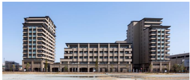
External view of Elegano Nishinomiya

This facility adds services that contribute toward improving healthy lifespans—such as a comprehensive medical examination system and a variety of programs—to 20-year-nursing care expertise while using knowledge related to housing and the utility of wood and greenery developed by Sumitomo Forestry. It will provide housing for the elderly as an evolved Elegano brand.