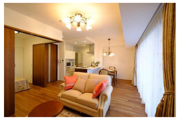
Standard unit that pursues ease of living (model room)