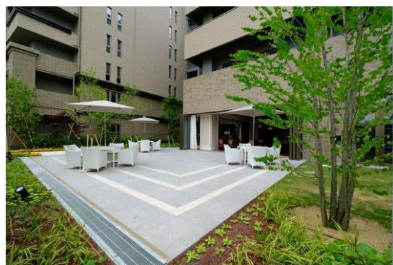
Outdoor terrace where even wheelchair users can easily enjoy the greenery