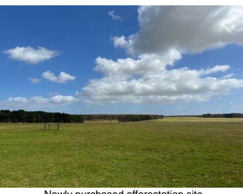
Newly purchased afforestation site

On February 19, 2024, SFA-NBS purchased 957 hectares of new land in the Gippsland region (270 km east of Melbourne) in eastern Victoria. By planting softwood trees on a long rotation, the Company aims to make a positive contribution to the increasing demand in Australia for wood products suitable for residential construction. Pending approval from the Clean Energy Regulator, the Company also aims to create carbon credits by harnessing the ability of planted forests and wood products to absorb and fix atmospheric CO<sub>2</sub>.