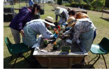
<Conceptual illustration of the horticultural therapy program>

Sumitomo Forestry will build a community-based system that supports users in their daily life, increasing the options for nursing care by developing its day care business in conjunction with its existing private-pay elderly care facilities.