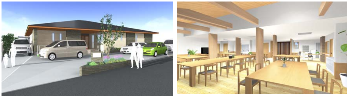
<Conceptual drawings of Tsundayama Center>