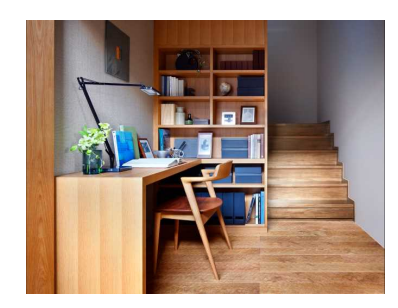
House with work space