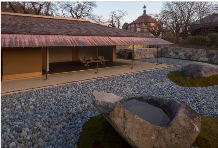
Exterior view of "Washin"