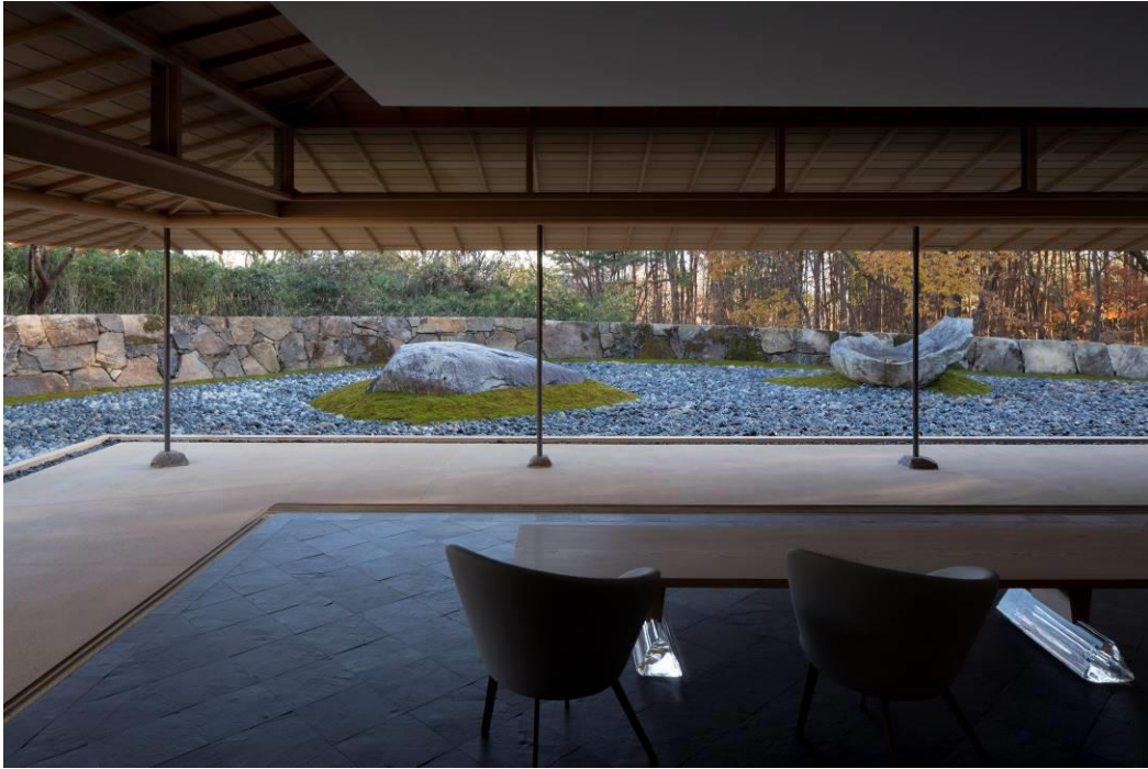
Interior view of “Washin”