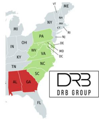
Areas served by DRB