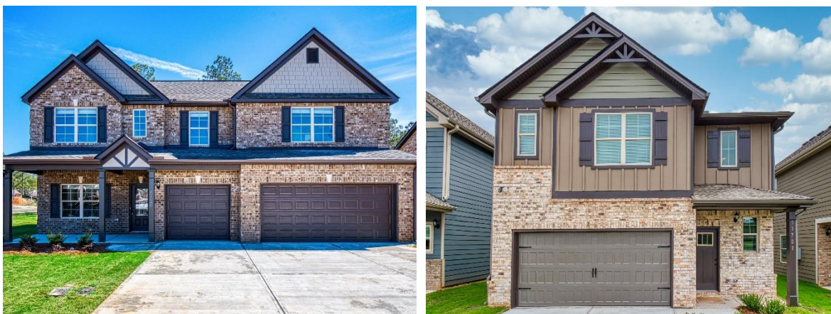
Exterior views of Knight Homes