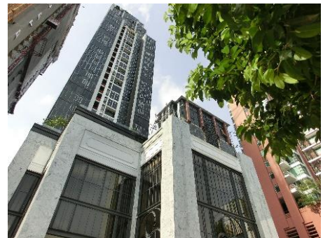
Exterior of HYDE Heritage Thonglor

Sumitomo Forestry Co., Ltd. (President and Representative Director: Toshiro Mitsuyoshi; Headquarters: Chiyoda-ku, Tokyo: hereinafter Sumitomo Forestry) announced that construction has been completed on HYDE Heritage Thonglor, a luxury condominium jointly developed with local companies in central Bangkok, Thailand. The 45-story building with two basement levels and a total of 311 units is located in the Thonglor area, an upscale residential area in central Bangkok where many Japanese people live. It is located a five-minute walk from the station, offering convenient transportation. It also has excellent common spaces such as a 360-degree view sky pool on the 40th floor and offers concierge services that enhance quality of life. Sumitomo Forestry’s design proposal has realized a luxurious design and a functional floor plan that considers the flow of daily life.