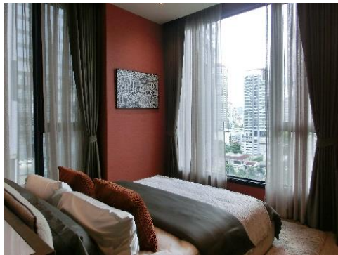
Model room interior (bedroom)

Each apartment was designed under the proposal of Sumitomo Forestry with floor plans that pursue functionality in areas such as furniture arrangement, the flow of daily life, and storage. In addition to using building materials from high-end manufacturers, including those in Japan, Kumagai Gumi Co., Ltd. (President: Yasunori Sakurano; Headquarters: Shinjuku-ku, Tokyo) also provided technical assistance to improve construction quality.