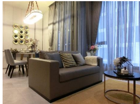
Model room interior (living room)

Model rooms, 1-bedroom type rooms (52.80m 2 ) and 2-bedroom type rooms (77.10 m 2 or 77.30m 2 ), in the building can be viewed.