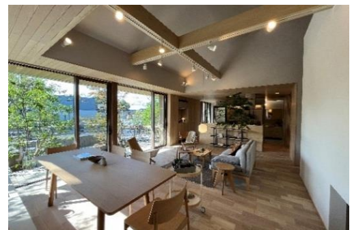
Interior with generous use of wood

LCCM (life cycle carbon minus) houses achieve a negative CO 2 balance over the building's entire life cycle. Sumitomo Forestry began selling LCCM houses as its environmental flagship model from April 22 nd . *1 With our proprietary BF (big frame) construction method to enhance longevity and the use of solar power and other renewable energies, we are striving to contribute to the realization of a decarbonized society.