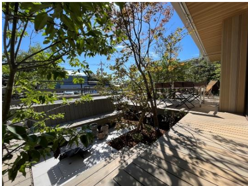
Wood deck that connects the interior and exterior

*6 Sumitomo Forestry Homes YouTube channel: https://www.youtube.com/c/sfc_ie