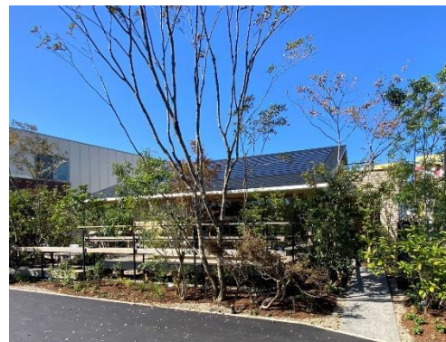
Exterior design that showcases the seasons