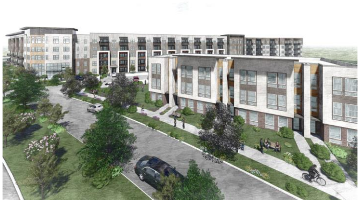
Artistic rendering of the completed complex

The construction site is located in Northglenn, a city approximately 16 kilometers from central Denver. Located near major highways, the property is a 15-minute drive to Broomfield, which has a high concentration of technology, medical and financial companies, a 20-minute drive to downtown Denver, and a 30-minute drive to Denver International Airport. It also boasts easy access to the RTD Light Rail and bus transit systems. With a stable employment environment and growing population, the Denver area continues to experience strong demand for housing, which this property aims to capture.