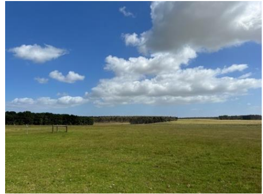
Newly purchased afforestation site