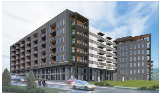
Artistic rendering of the completed complex

Targeting active young adults who aspire to live an urban lifestyle where they can live, work and play in the heart of Atlanta, NOVEL Blandtown features 250 units, ranging from studios to two-bedroom apartments. The community will offer a roof-top lounge and pool, a central courtyard with a wooden deck, and a full range of other amenities, including a large screen for movie viewing.