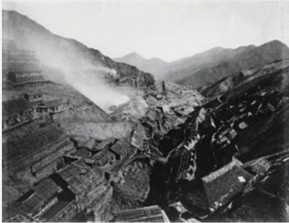
Mount Besshi ravaged by the impact of mining operations during the Meiji era