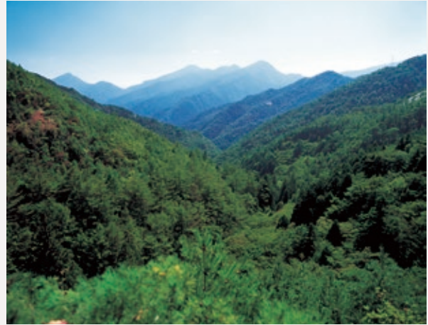
Mount Besshi today (Ehime)